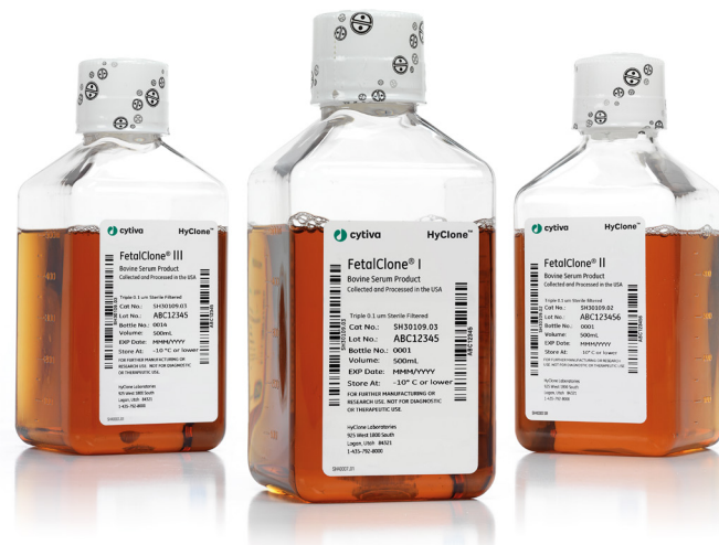
Fig 1. FetalClone engineered serum products show equivalent performance to FBS at a reduced cost and without limitation in supply.

Sera should be stored at -10°C or lower. Once thawed, sera should be stored at 2°C to 8°C. To maintain quality, a conservative storage recommendation for sera at this temperature is no longer than six