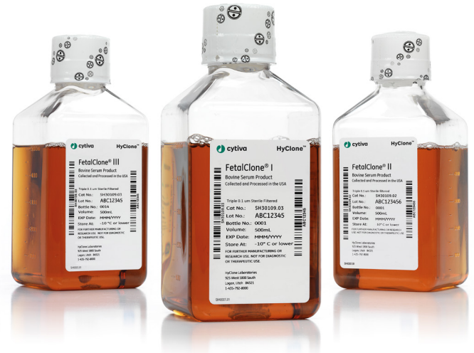
Fig 1. FetalClone engineered serum products show equivalent performance to FBS at a reduced cost and without limitation in supply.

Sera should be stored at -10°C or lower. Once thawed, sera should be stored at 2°C to 8°C. To maintain quality, a conservative storage recommendation for sera at this temperature is no longer than six weeks. If the serum