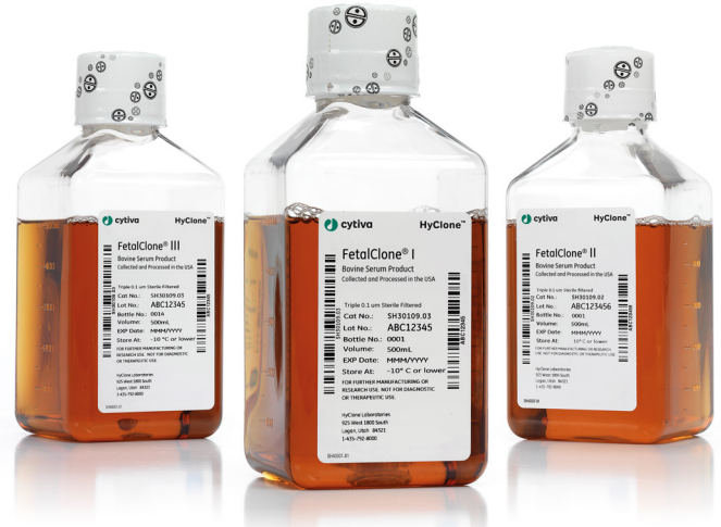
Fig 1. FetalClone engineered serum products show equivalent performance to FBS at a reduced cost and without limitation in supply.

Sera should be stored at -10°C or lower. Once thawed, sera should be stored at 2°C to 8°C. To maintain quality, a conservative storage recommendation for sera at this temperature is no longer than six weeks. If the serum needs to be stored longer than six weeks after opening, it is recommended to aliquot the serum into convenient volumes and refreeze.